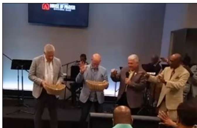
Art in Newtown to talk about the SMPC Mobile Medical Unit - 7-18-25