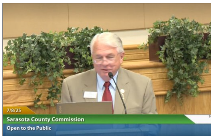
Art addressing the Sarasota County Commission 7-8-25