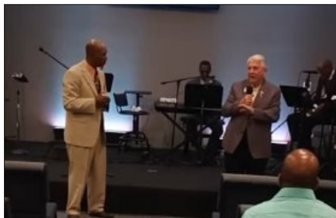
Art in Newtown House of Prayer- talking about the mobile medical unit